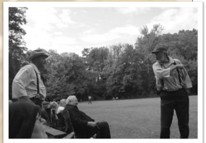
The Carp called from the bullpen to pitch.