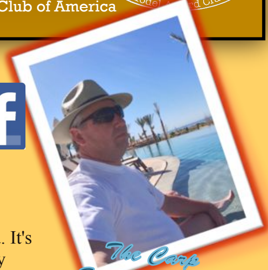
The Carp Editor in Chief

One of our fun events that we have attended the last few years is “Deep River Grinders Baseball” played in Holbert, IN. Rules written in 1858 govern the play. Cranks (the fans) can enjoy an ice-cold sarsaparilla. It's the gentlemanly behavior of the players and the rules they play by. The men portray players of the mid-1800s, when courtesy prevailed on and off the playing field. There is no swearing, no spitting and no ungentlemanly behavior anywhere during the games. They also can and do make themselves at home sampling the picnic baskets of the fans. As desperation set upon the team (as they were losing by quite a margin to the “ Champion Hilltoppers ”) they pulled in from the bullpen a secrete weapon. Me! Unfortunately the deficit was too big and my crack pitching was to no avail. We had around 30 from our club there and it was a great afternoon. If you have never been to a game bring a picnic basket and your chairs for a fun afternoon.