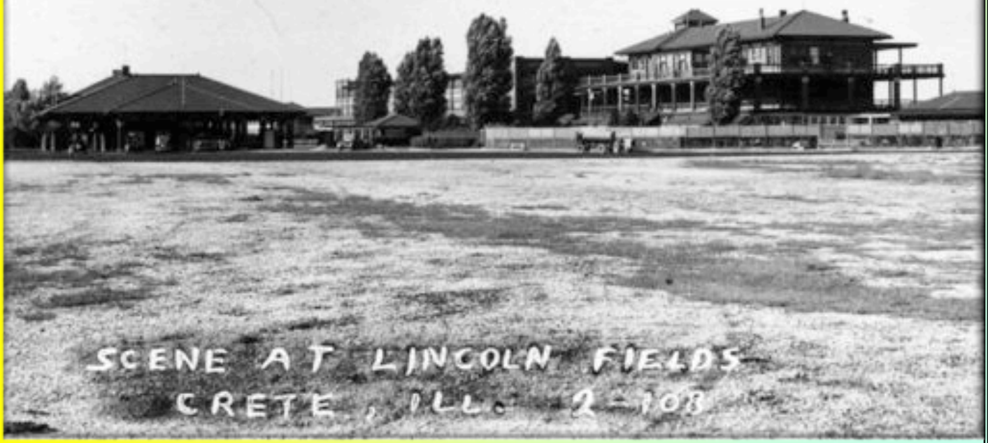
SCENE AT LINCOLN FIELDS CRETE, ILL. 2-103